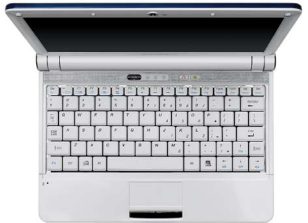
Lenovo IdeaPad S10 Deep Blue