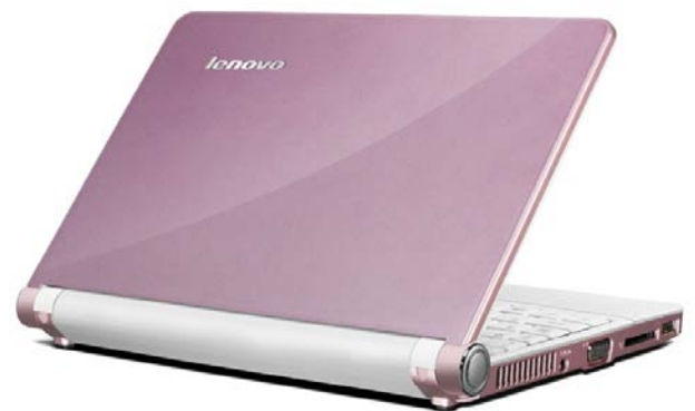
Lenovo IdeaPad S10 Pastel Pink