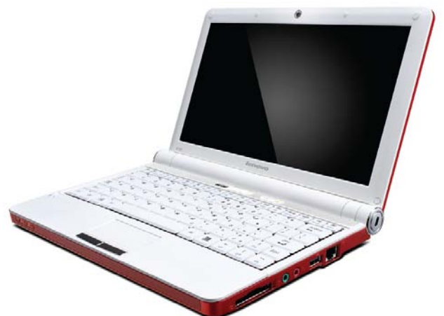
Lenovo IdeaPad S10 Ruby Red