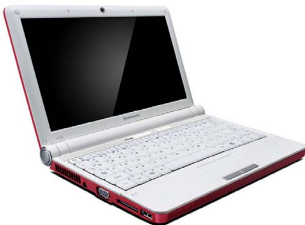
Lenovo IdeaPad S10 Ruby Red