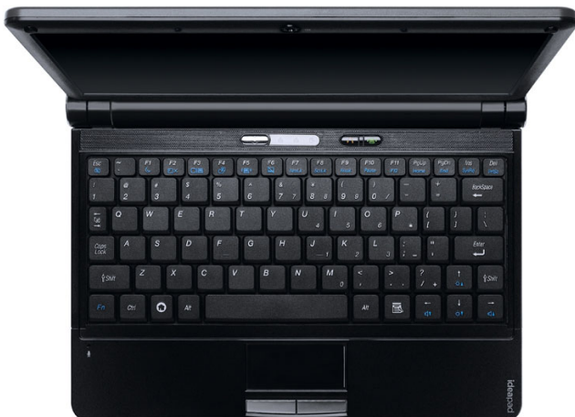
Lenovo IdeaPad S10e