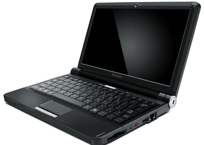
Lenovo IdeaPad S10e