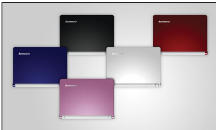
Lenovo IdeaPad S10 Bold Black, Ruby Red, Deep Blue, Classic White, Pastel Pink