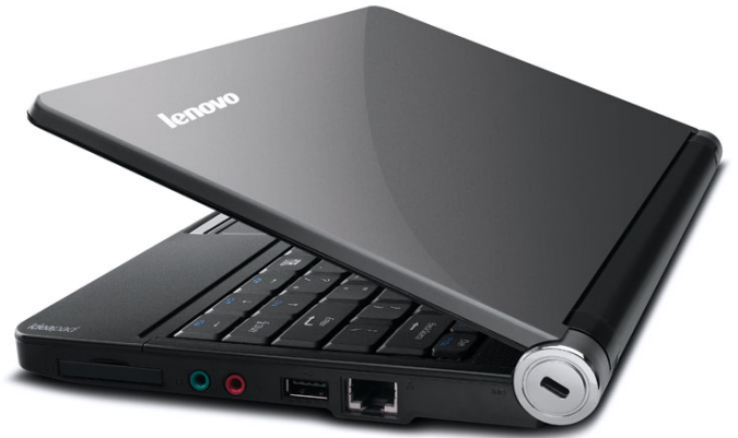
Lenovo IdeaPad S9e