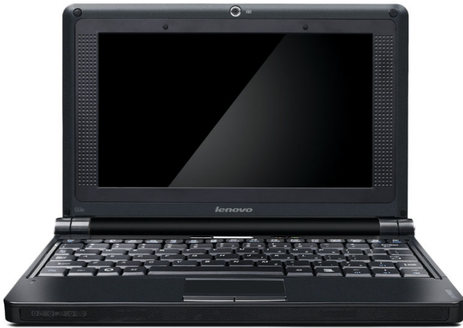
Lenovo IdeaPad S9e