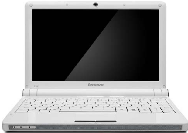
Lenovo IdeaPad S10 Classic White