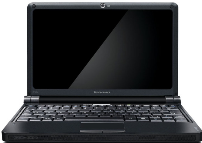
Lenovo IdeaPad S10e