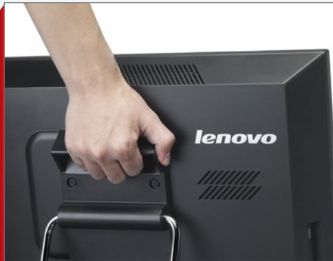
The Lenovo ThinkCentre® A70z All-in-One PC powered by Intel® processors