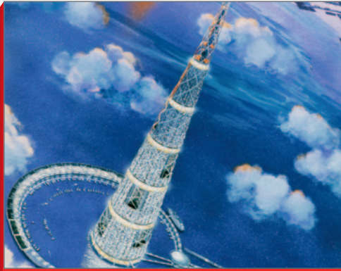
Rendering of Millenium Tower, on ThinkStation workstation.